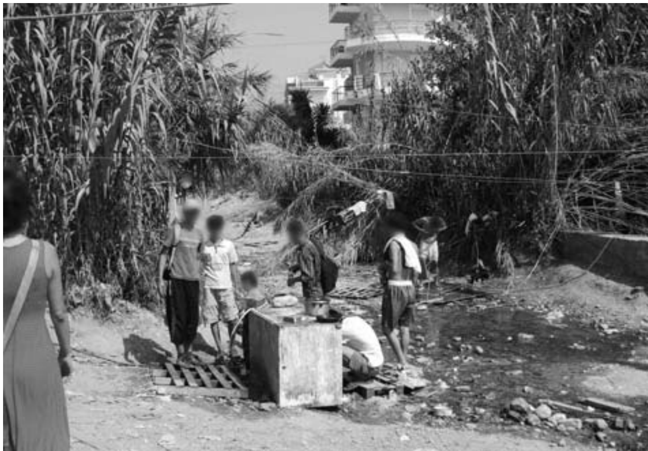
Patras: unsheltered refugees at a river, which serves as the only water supply

The people from the camp were trying to get into the off-limits port area. They wanted to reach Italy on one of the ferries. Sometimes they tried to get on board by clinging to lorries. Again, we heard of abuse by the Greek