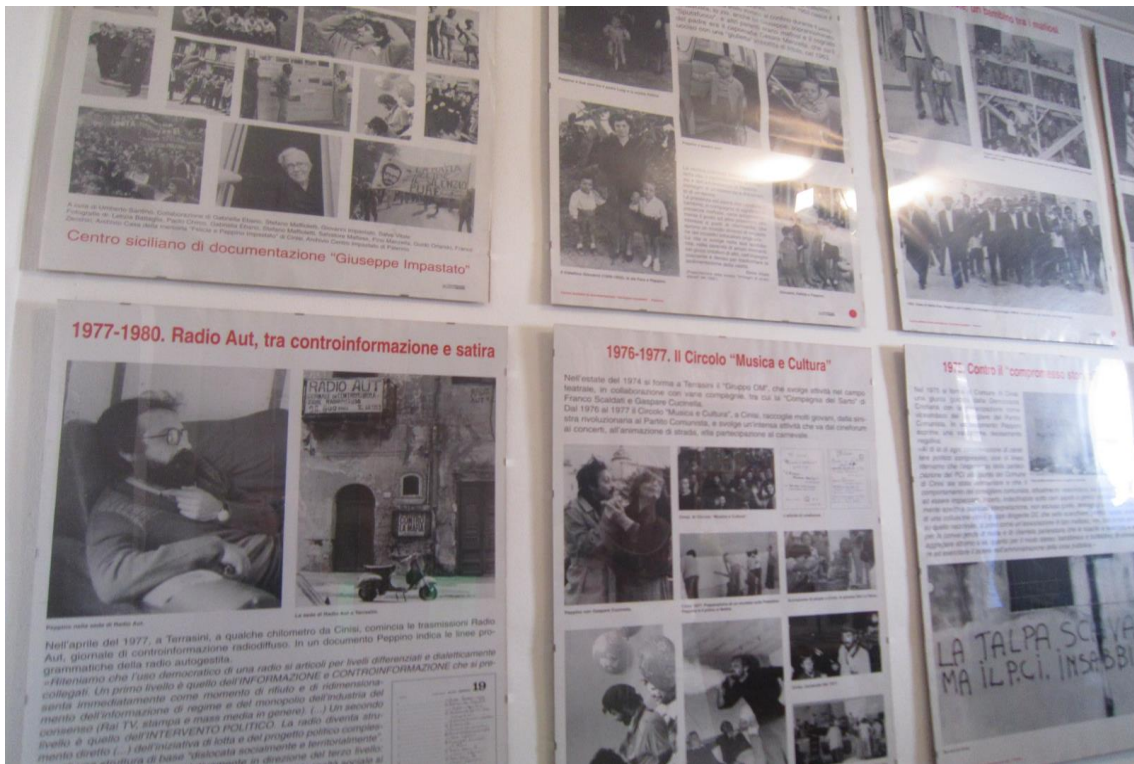
Peppino Impastato was a social and political activist who was killed by Mafia in 1978. He was reacting against his father, a man of Mafia. During our visit at the Casa Memoria in Cinisi, the