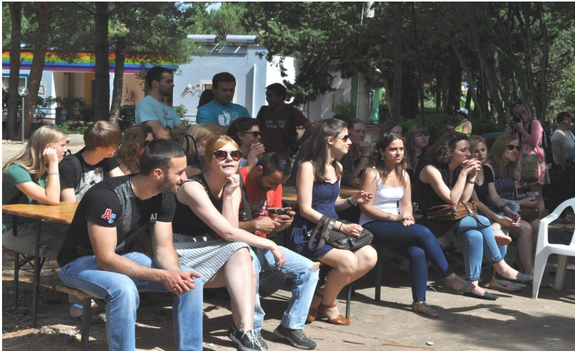
The state tries to fight Mafia by reusing confiscated goods of Mafia. Libera-mente is a social cooperative which manages confiscated goods from Mafia now addressed to social aims. They offer ecological holiday homes to rent in a green environment.